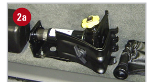
Remove wheel blocks from jack, then loosen jack.