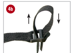
Ribs on buckle should face up. Thread strap through buckle as shown.