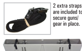
2 extra straps are included to secure guns/gear in place.