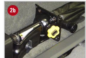
Rotate jack so yellow knob faces outward (as pictured).